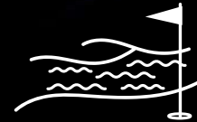
GOLF COURSE WITH LAKE