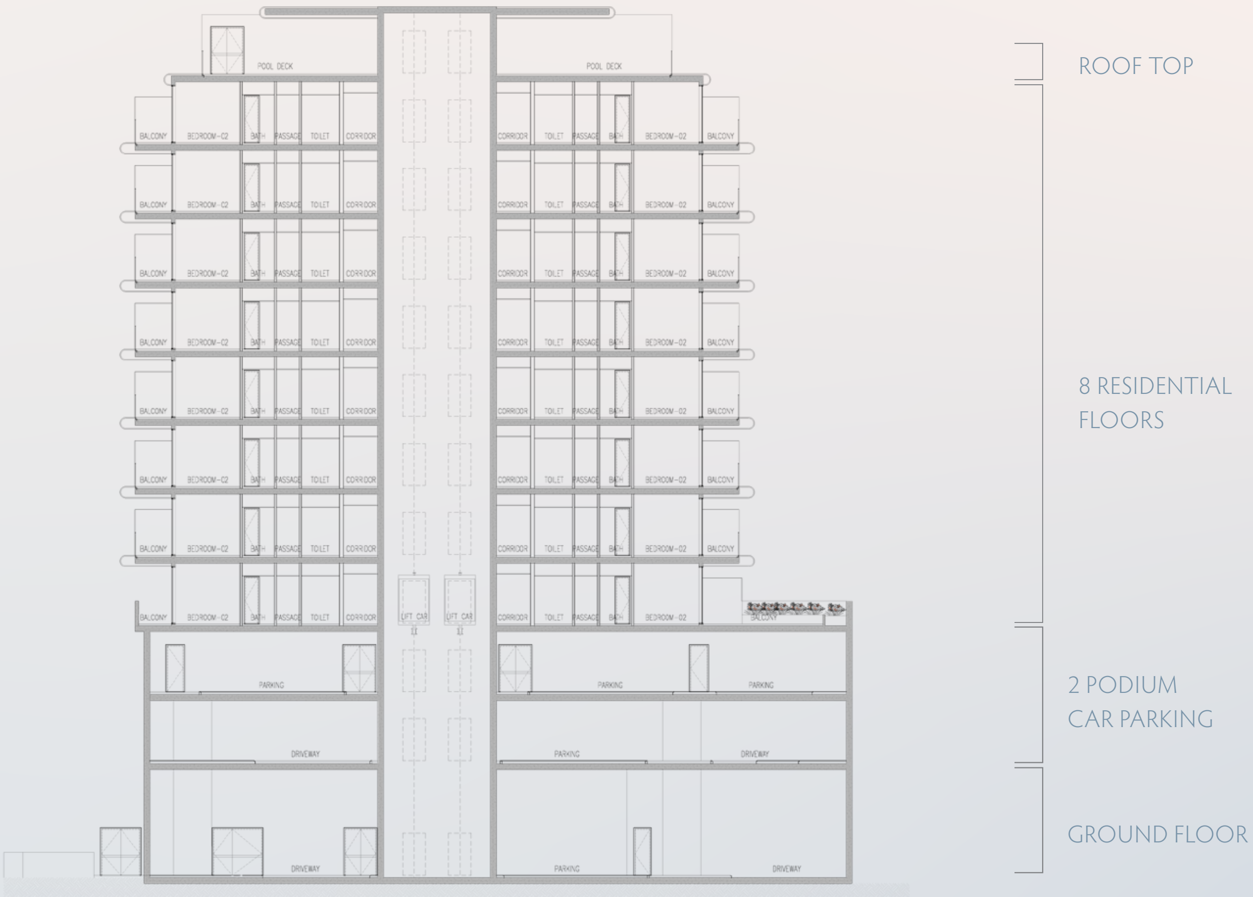
G + 2 PODIUM CAR PARKING + 8 RESIDENTIAL FLOORS + RF RESIDENTIAL