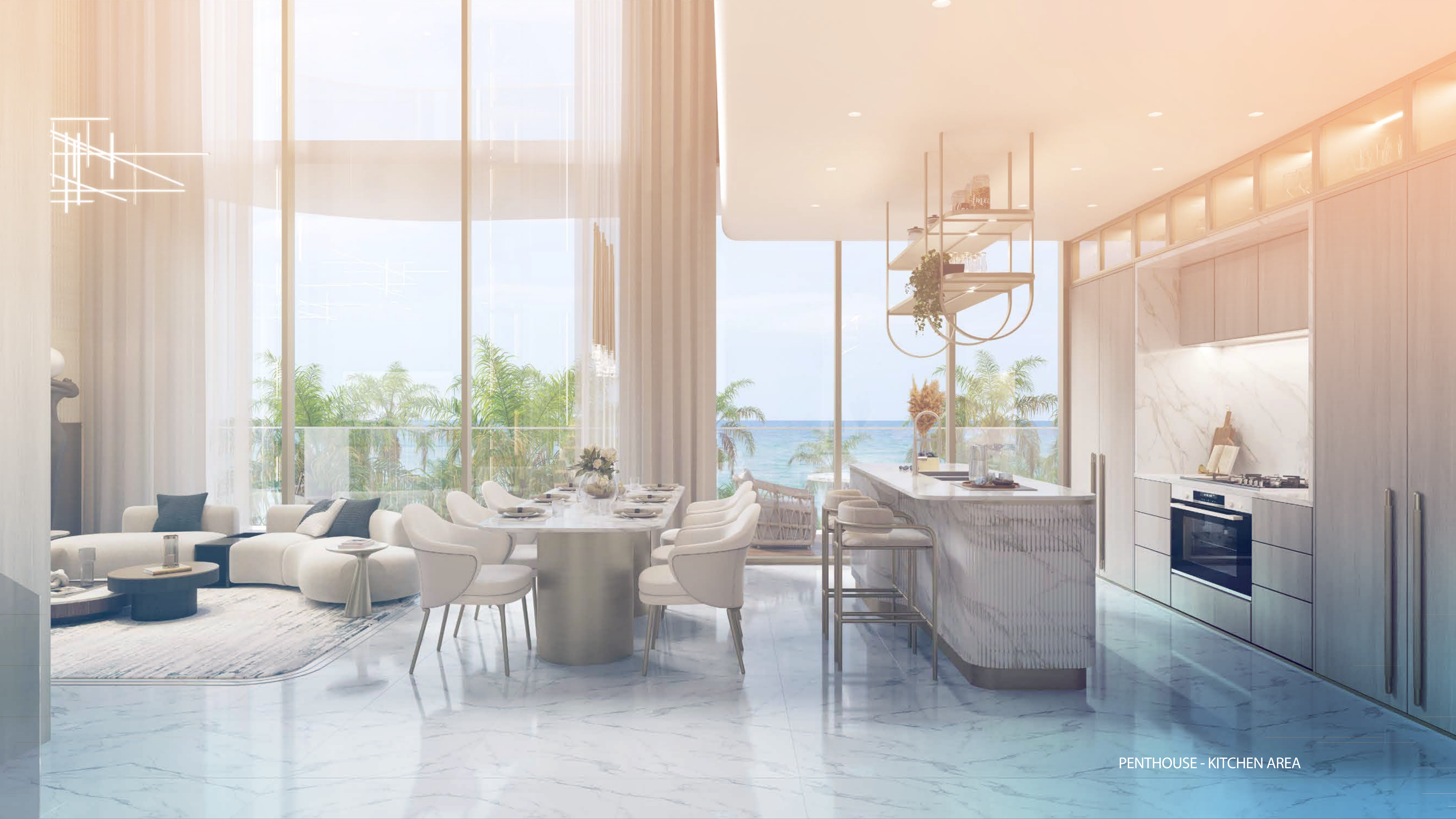
PENTHOUSE - KITCHEN AREA