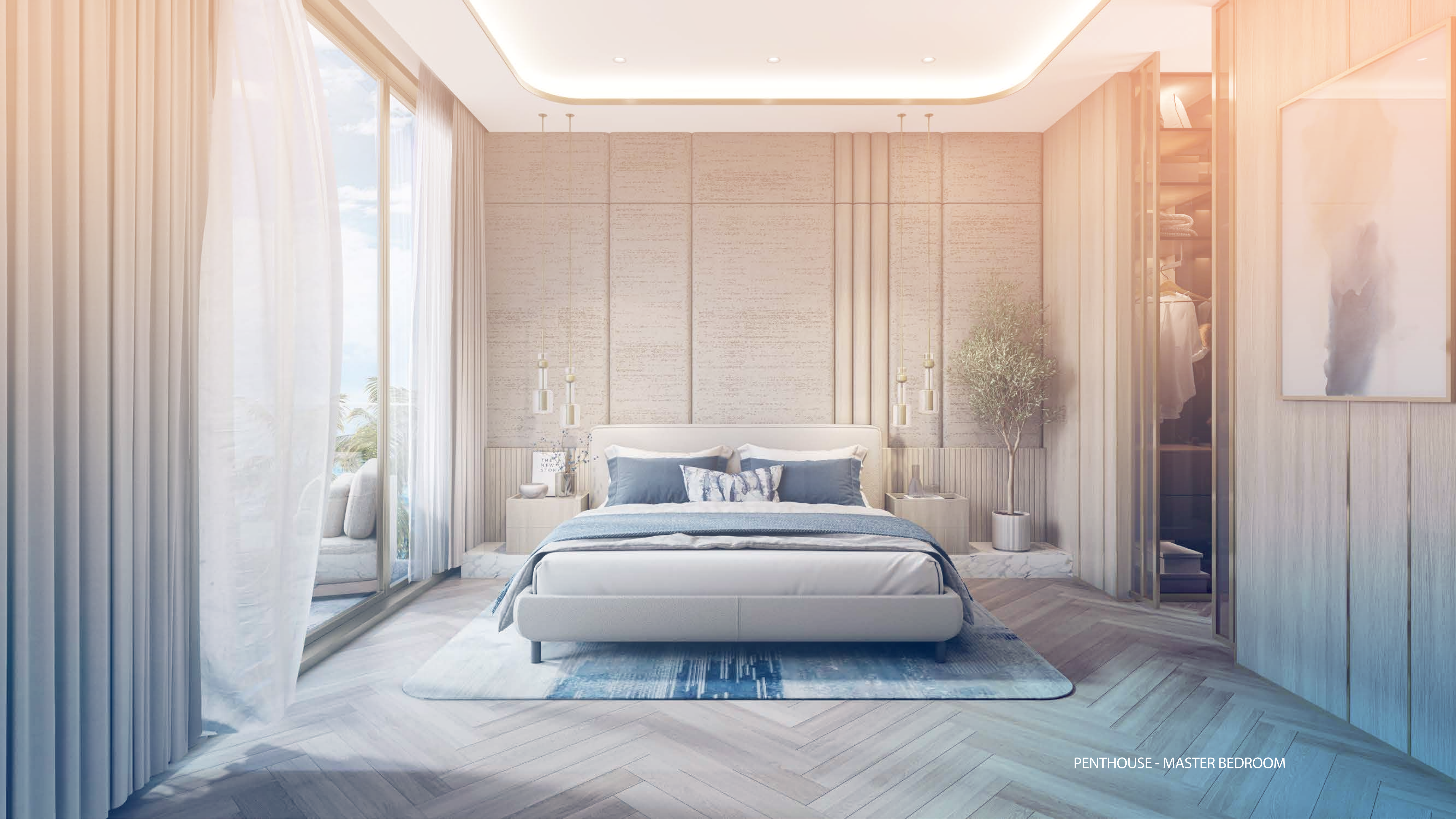
PENTHOUSE - MASTER BEDROOM