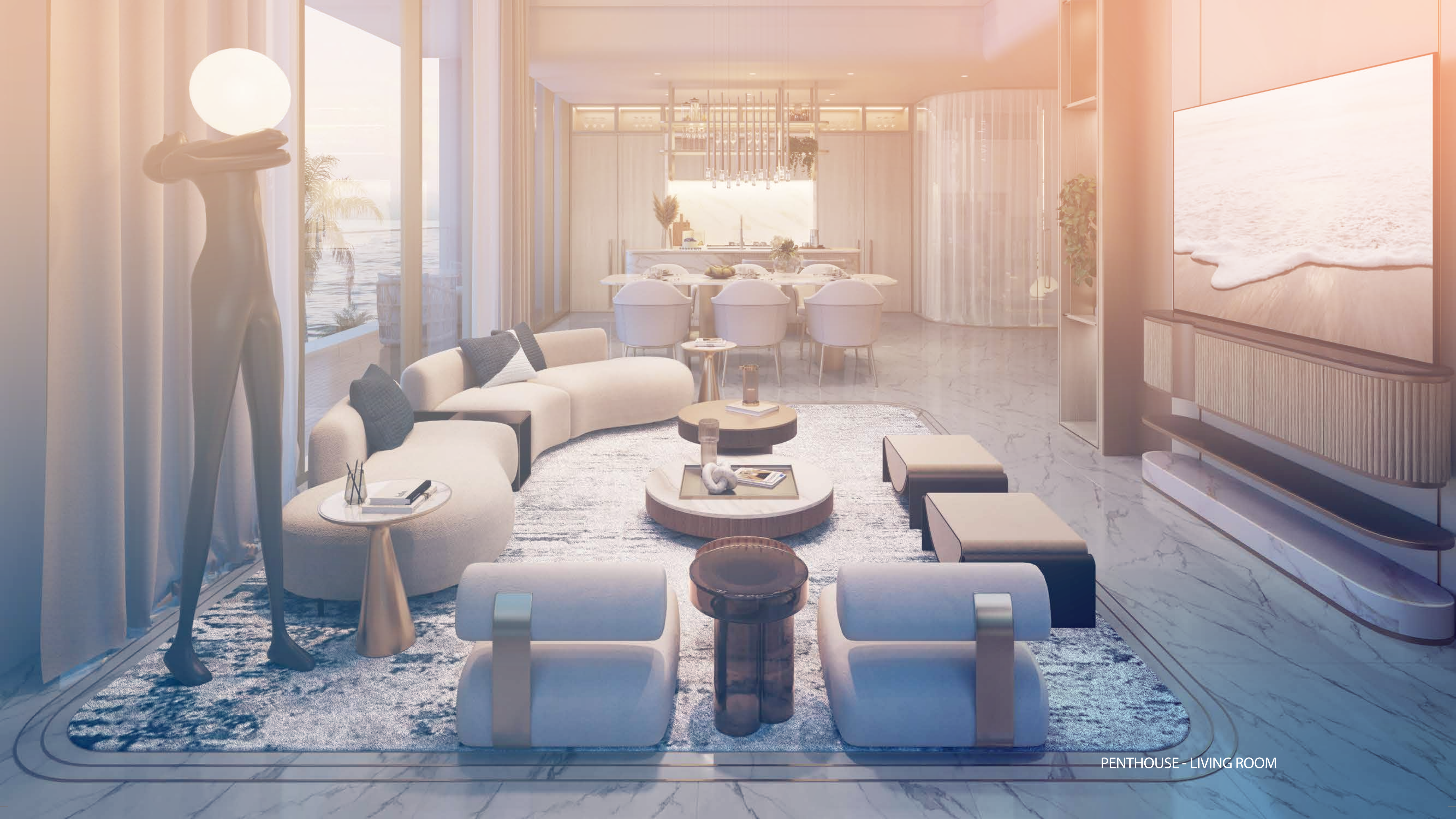
PENTHOUSE - LIVING ROOM