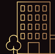
RESIDENTIAL TOWER IN JVC