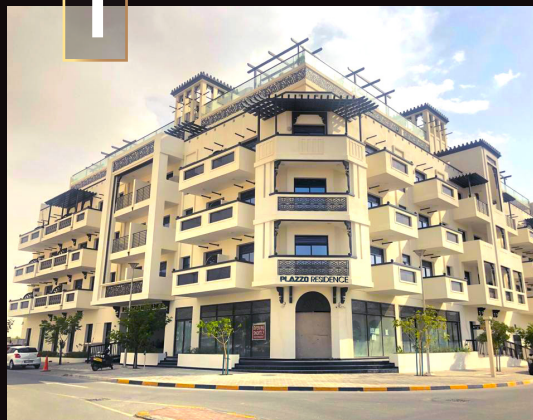
PLAZZO RESIDENCE - JVT