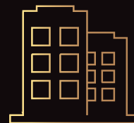
RESIDENTIAL TOWER IN LIWAN