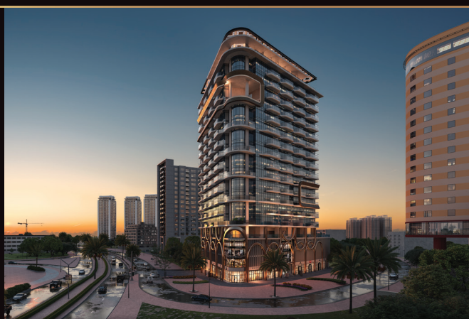
EMPIRE LIVINGS - DUBAI SCIENCE PARK