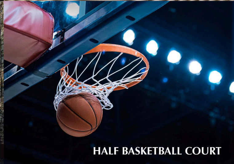
HALF BASKETBALL COURT