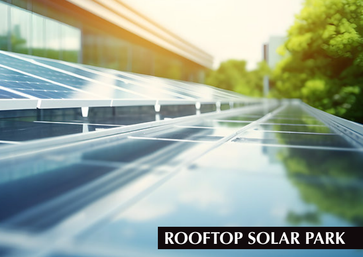
ROOFTOP SOLAR PARK