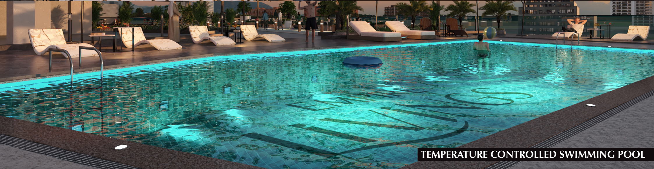
TEMPERATURE CONTROLLED SWIMMING POOL