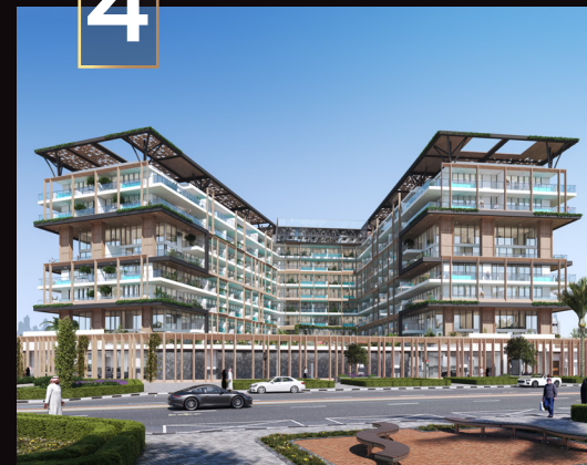
EMPIRE ESTATES - ARJAN