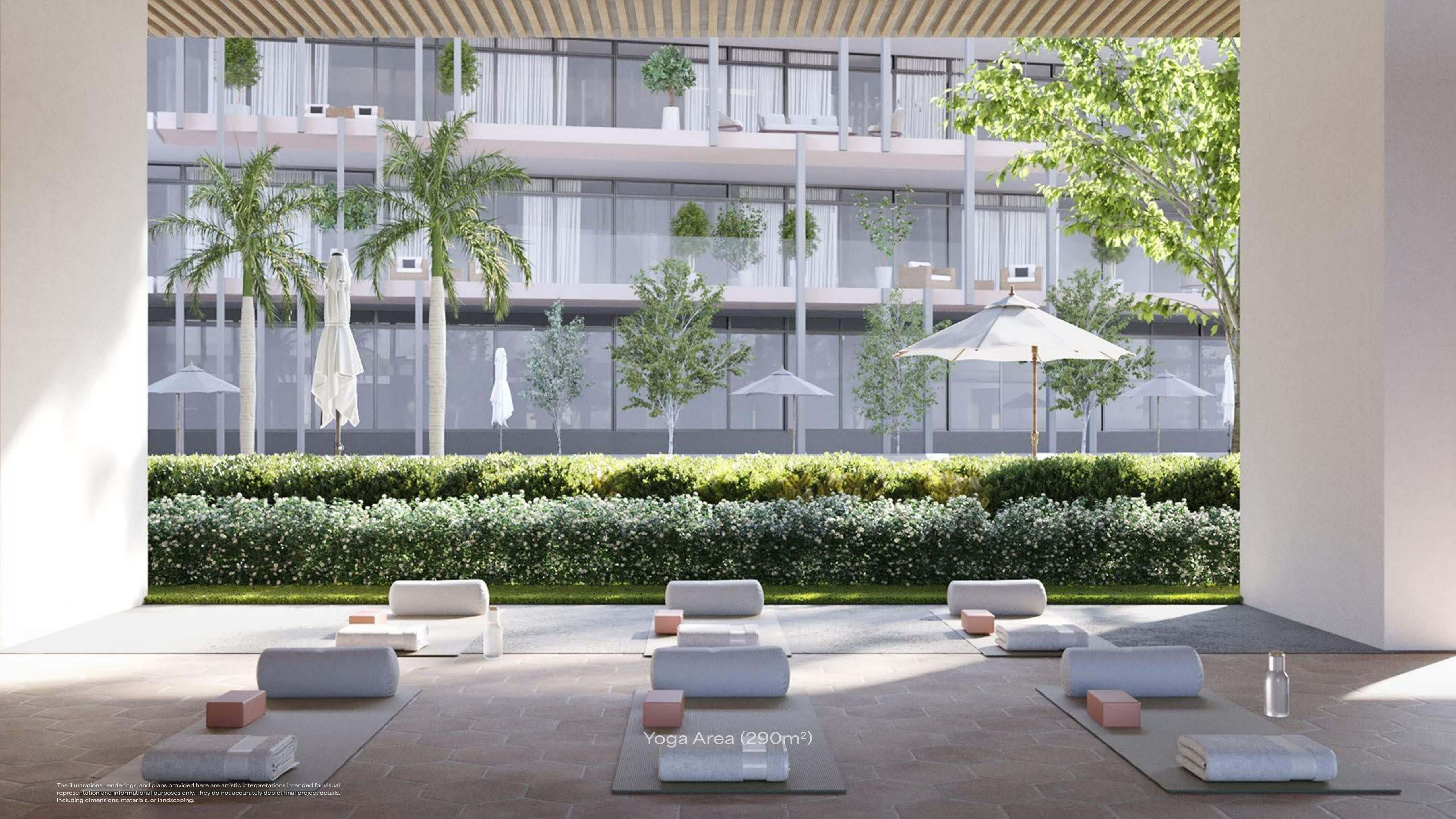
Yoga Area (290m 2 )