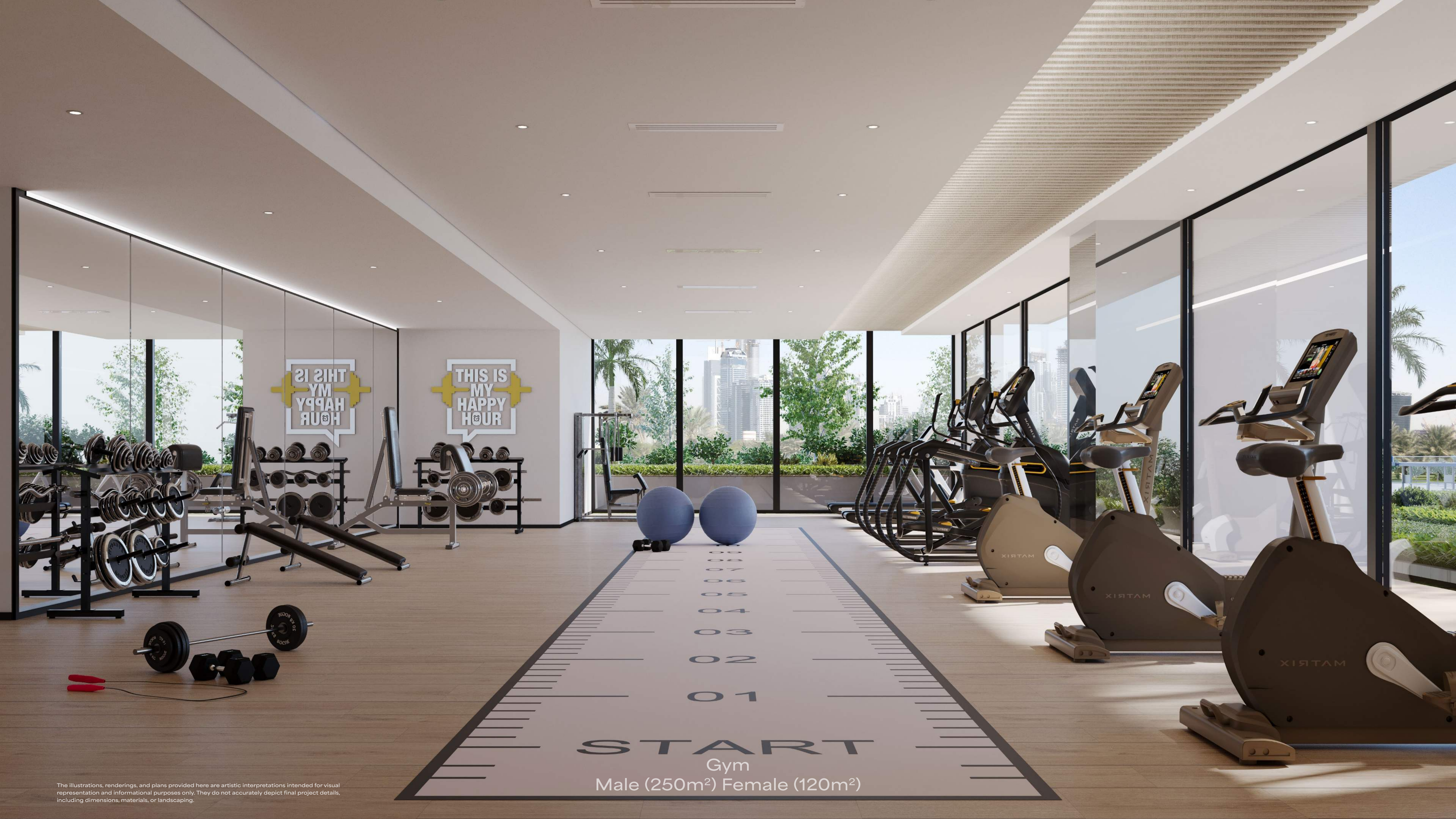
Gym Male (250m 2 ) Female (120m 2 )