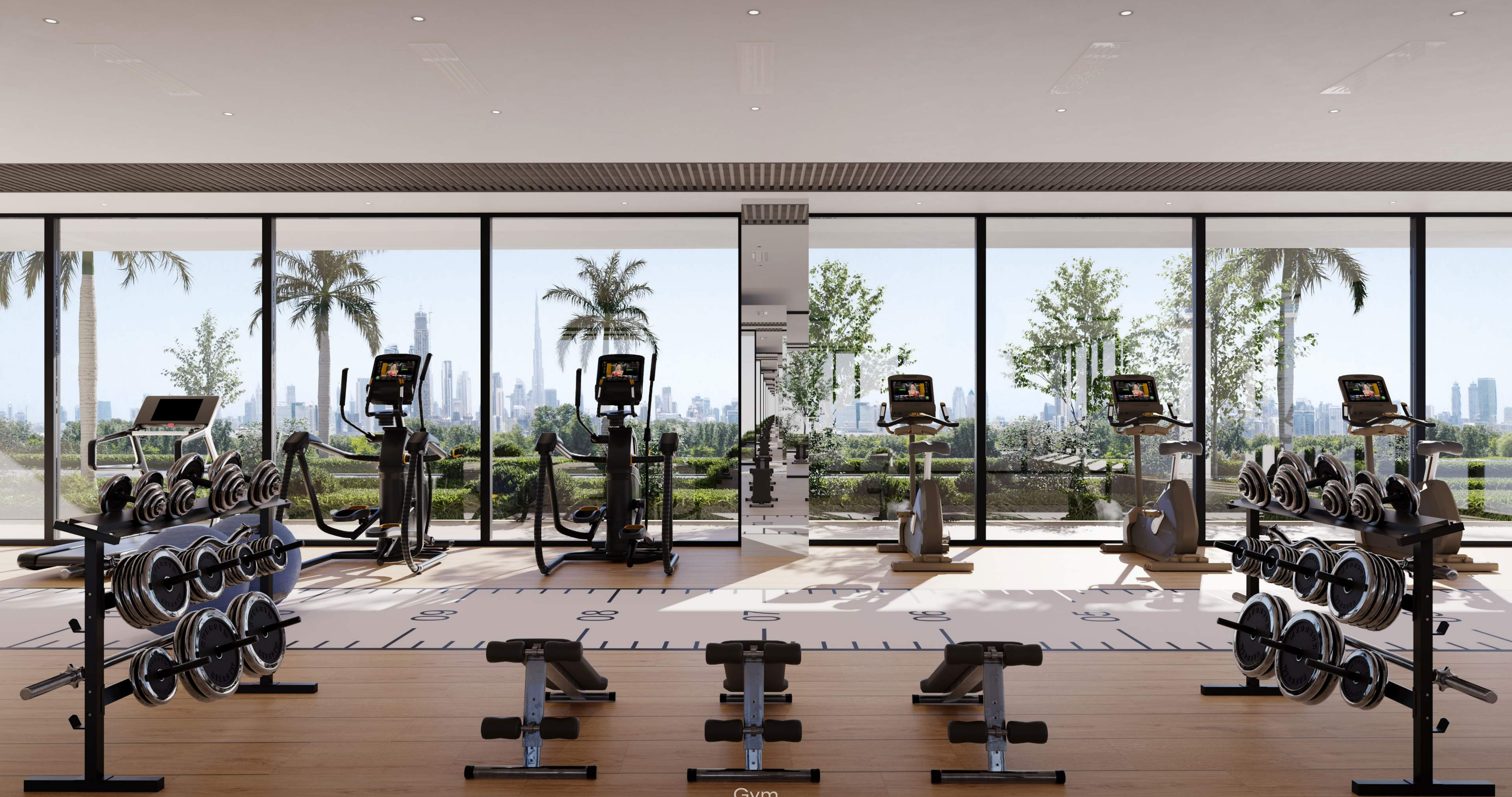
Gym Male (250m 2 ) Female (120m 2 )

The illustrations, renderings, and plans provided here are artistic interpretations intended for visual representation and informational purposes only. They do not accurately depict final project details, including dimensions, materials, or landscaping.