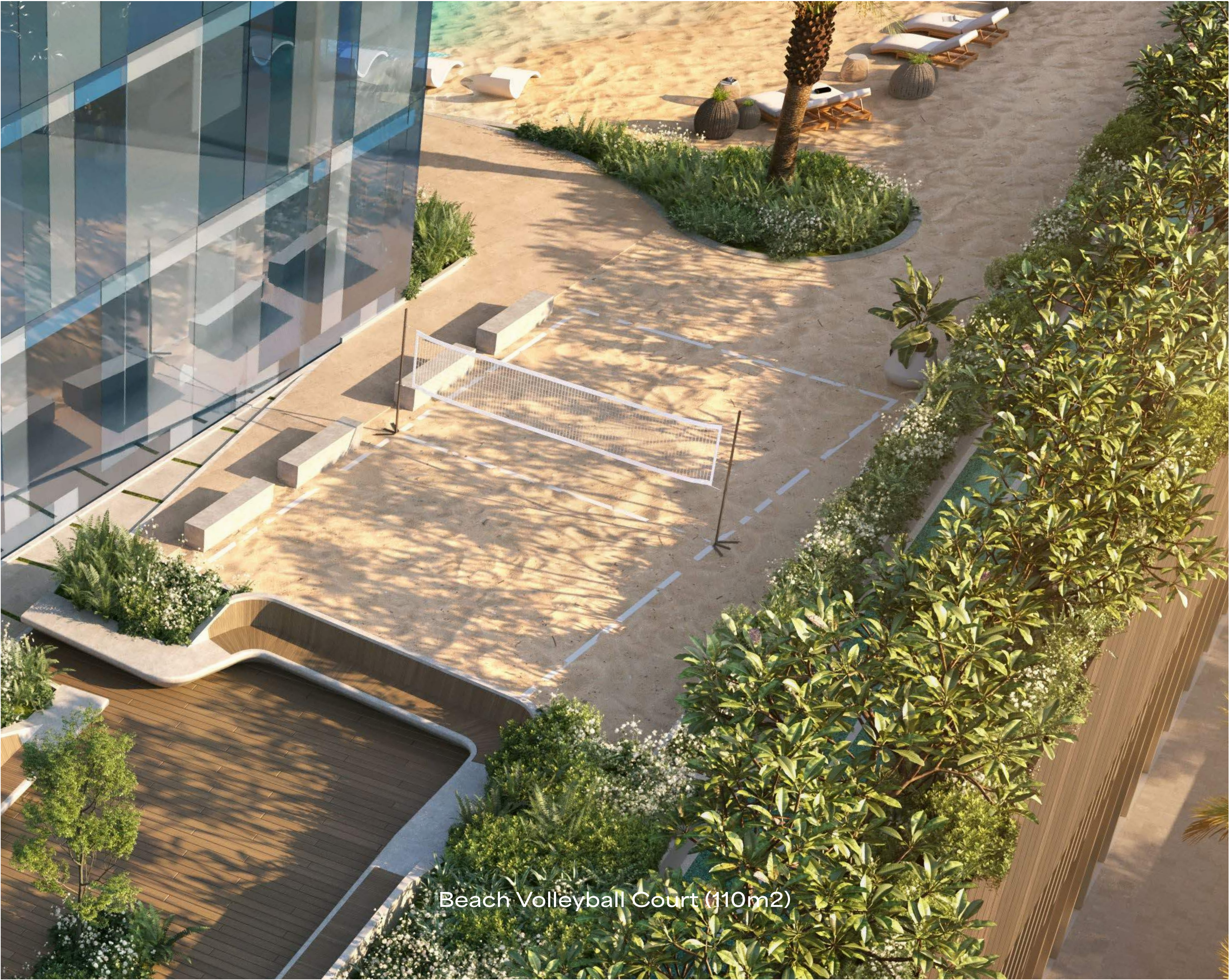
Beach Volleyball Court (110m 2 )