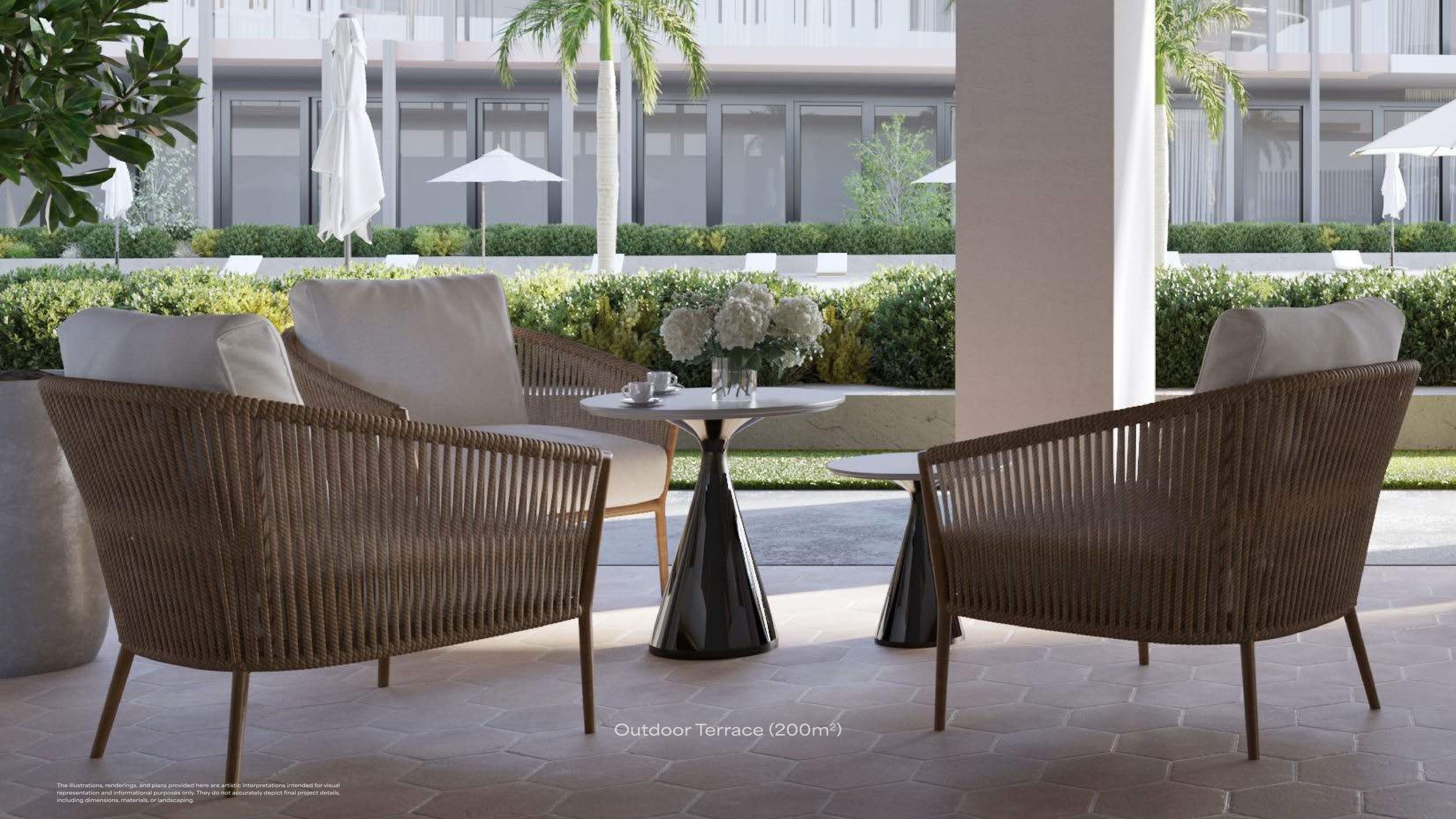
Outdoor Terrace (200m 2 )