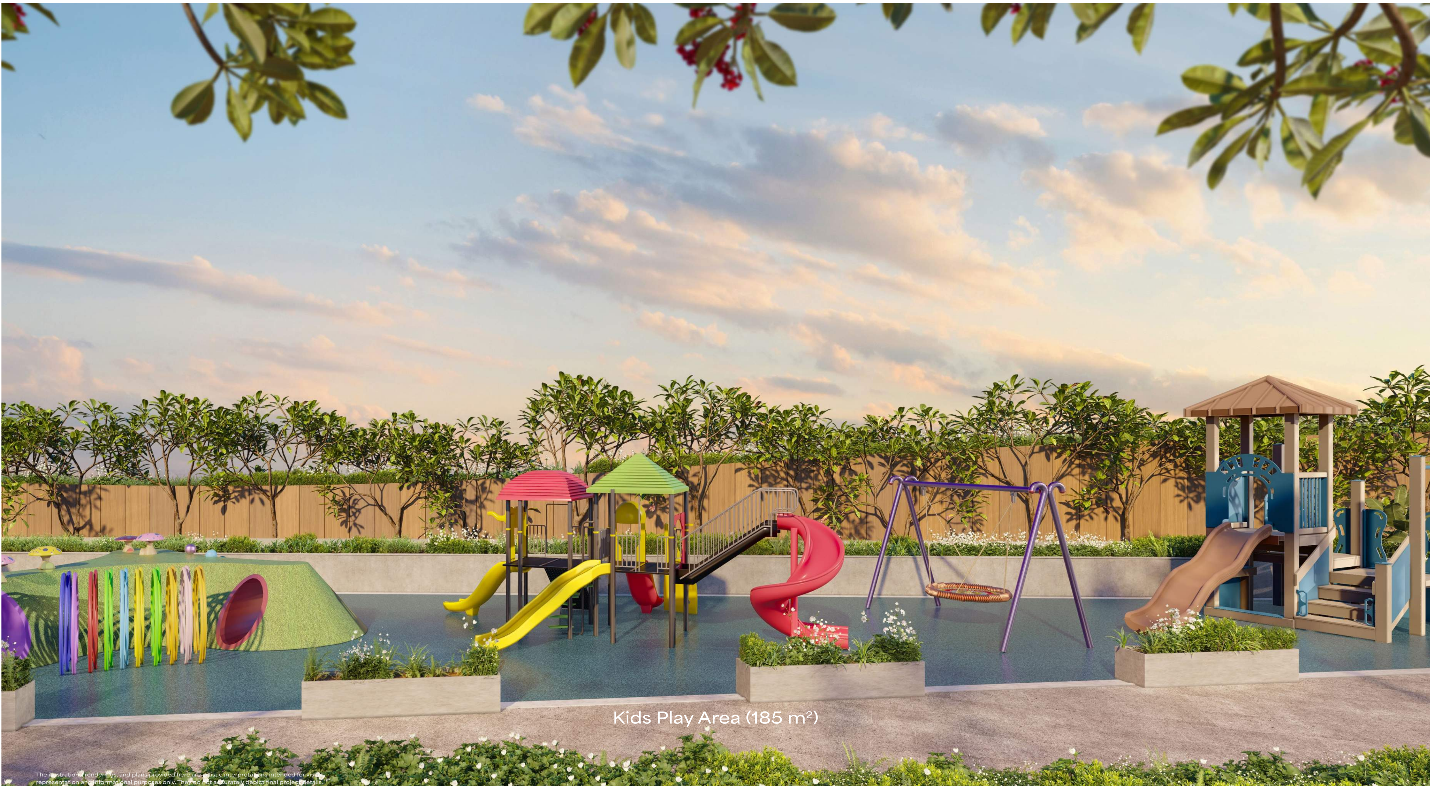
Kids Play Area (185 m 2 )