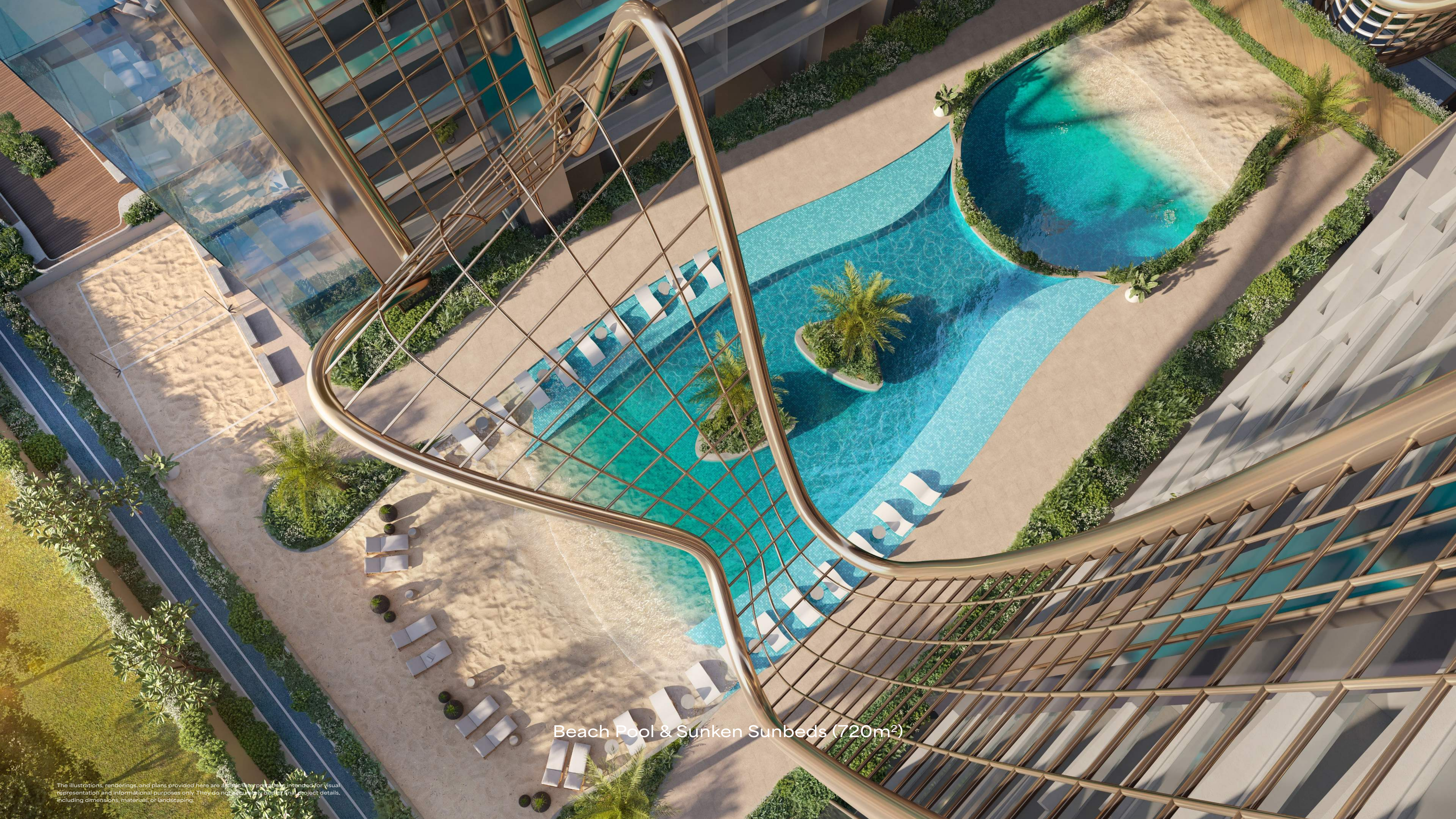
Beach Pool & Sunken Sunbeds (720m 2 )