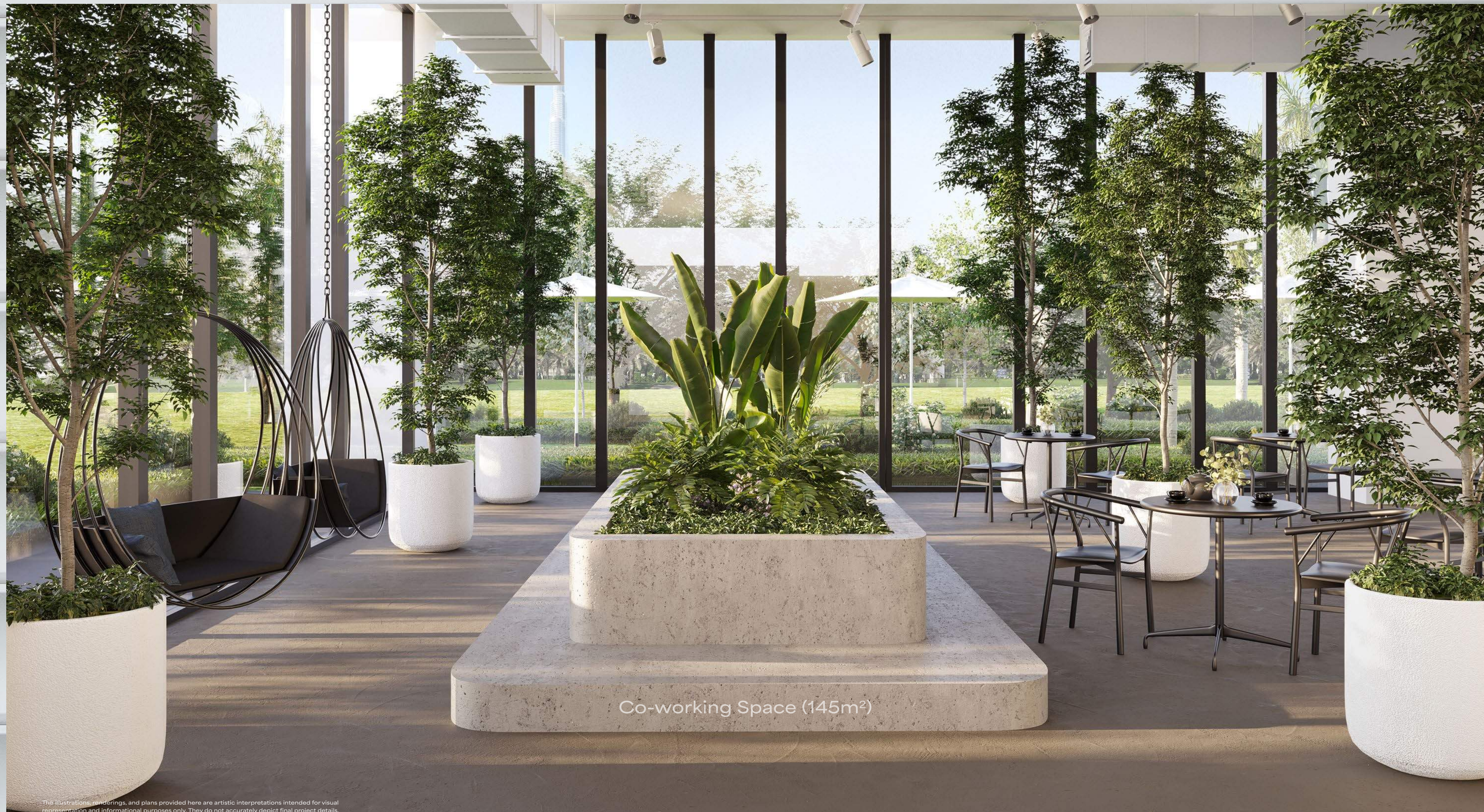
Co-working Space (145m 2 )