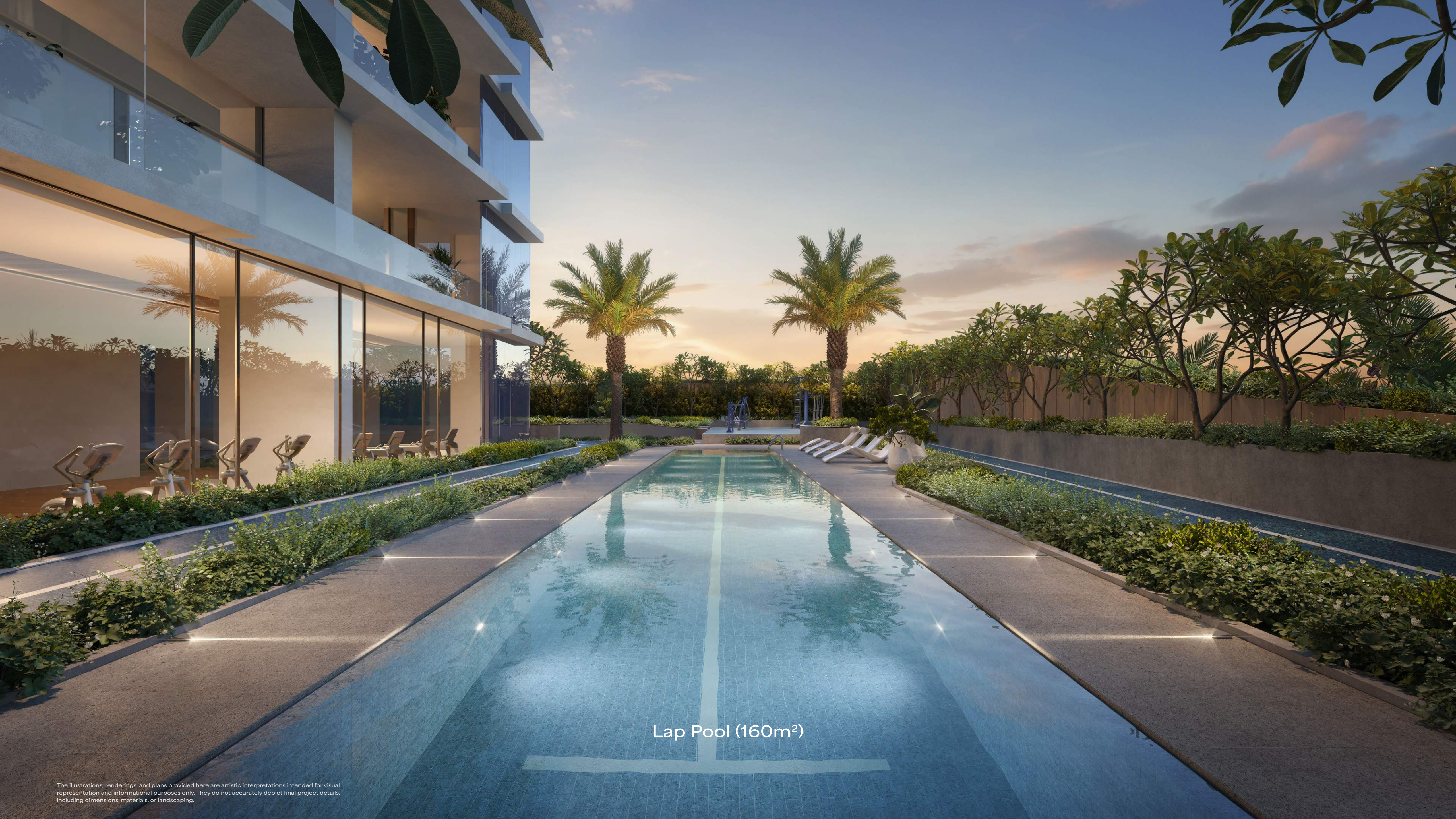
Lap Pool (160m 2 )