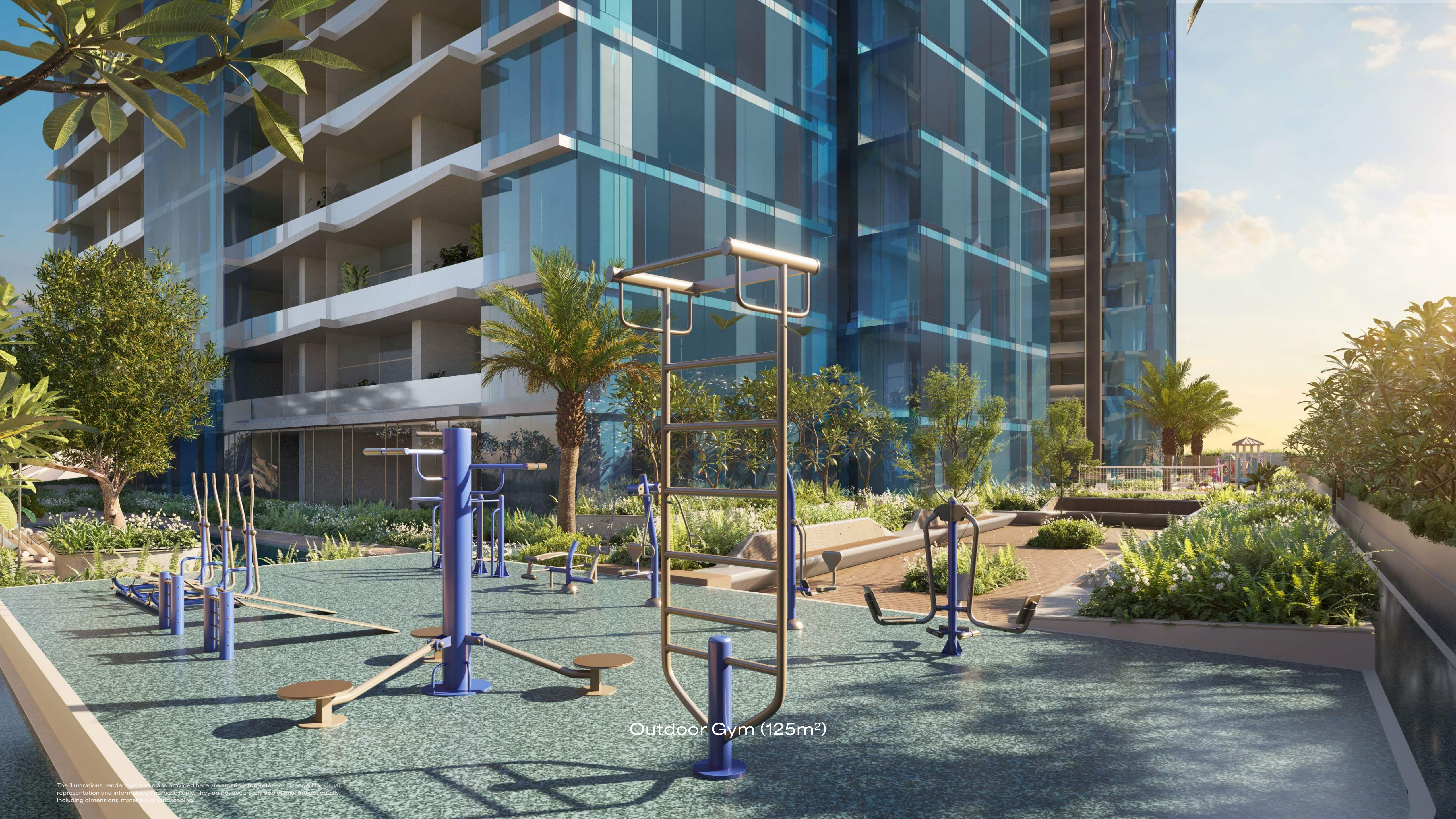
Outdoor Gym (125m 2 )