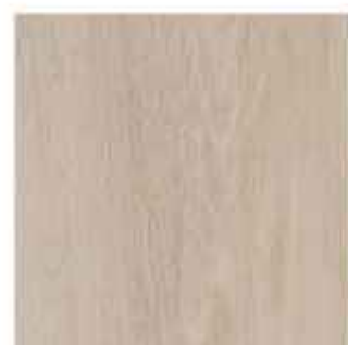
TAN OAK WOOD