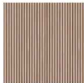
FLUTED TAN OAK

All finishes are subject to change without notice at our sole discretion for any reason including aesthetic purposes.