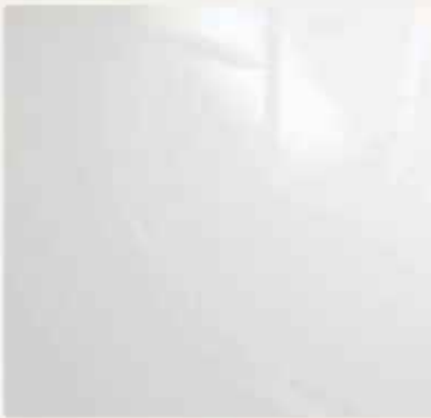
Glossy White Wood

All finishes are subject to change without notice at our sole discretion for any reason including aesthetic purposes.