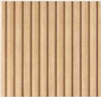
Fluted Oak Wood