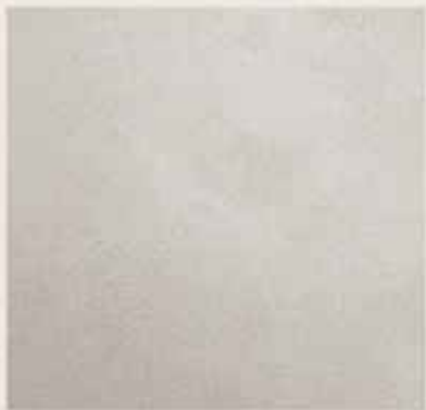
Light Grey Honed Concrete Paint