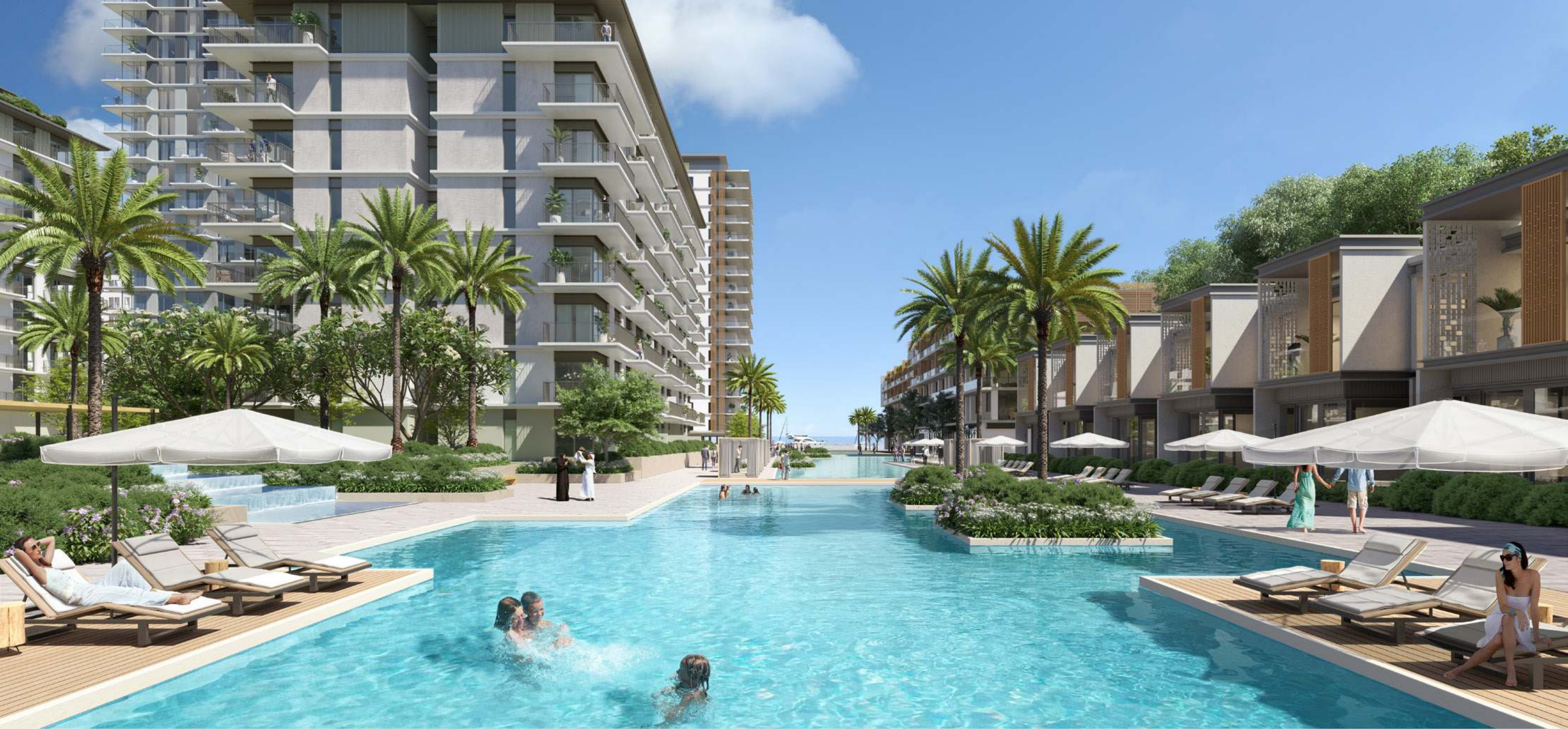
The Canal Pool