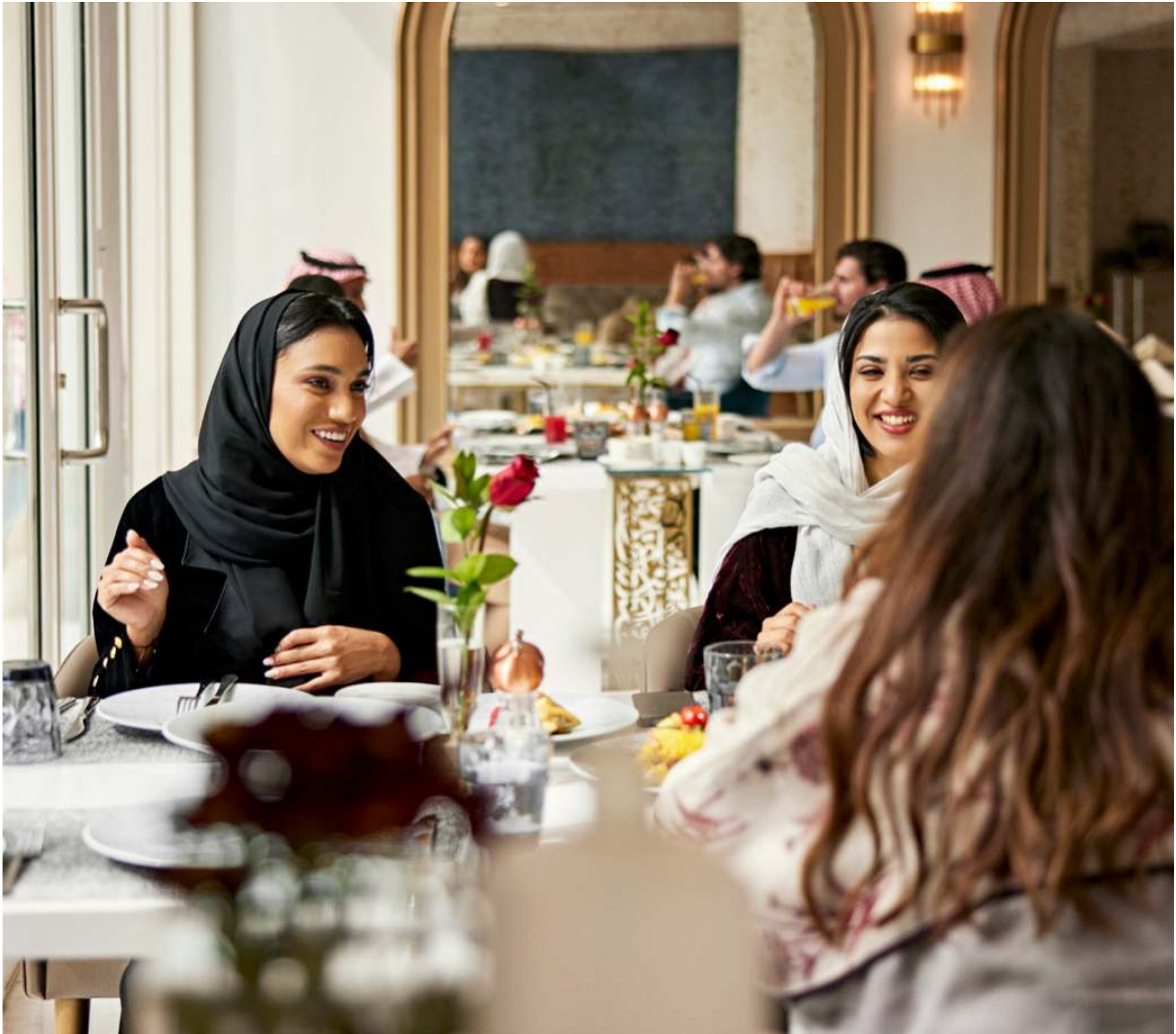
Retail & Dining